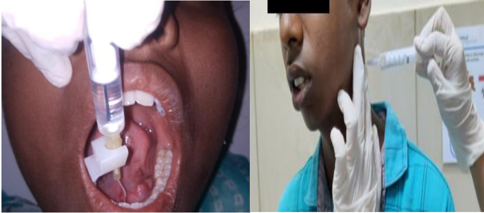
Fine Needle Aspiration Cytology

Oral Medicine and Radiology department of Chettinad Dental College is well-equipped with instruments that are used for extended diagnostic purposes and helped with our patients' successful prognoses.